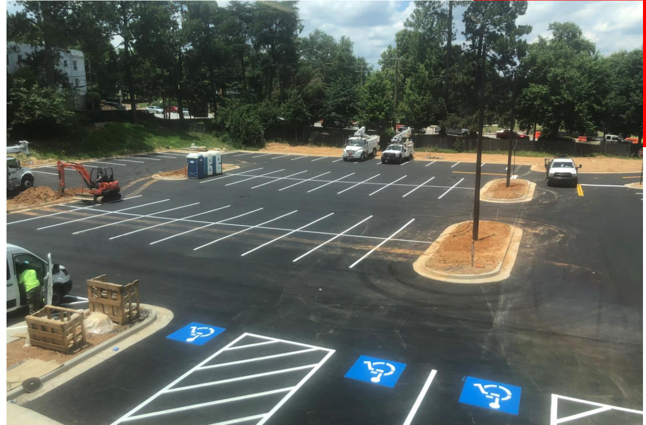
Striping, Signage, and Parking Lot Lighting Completed at New Addition Building