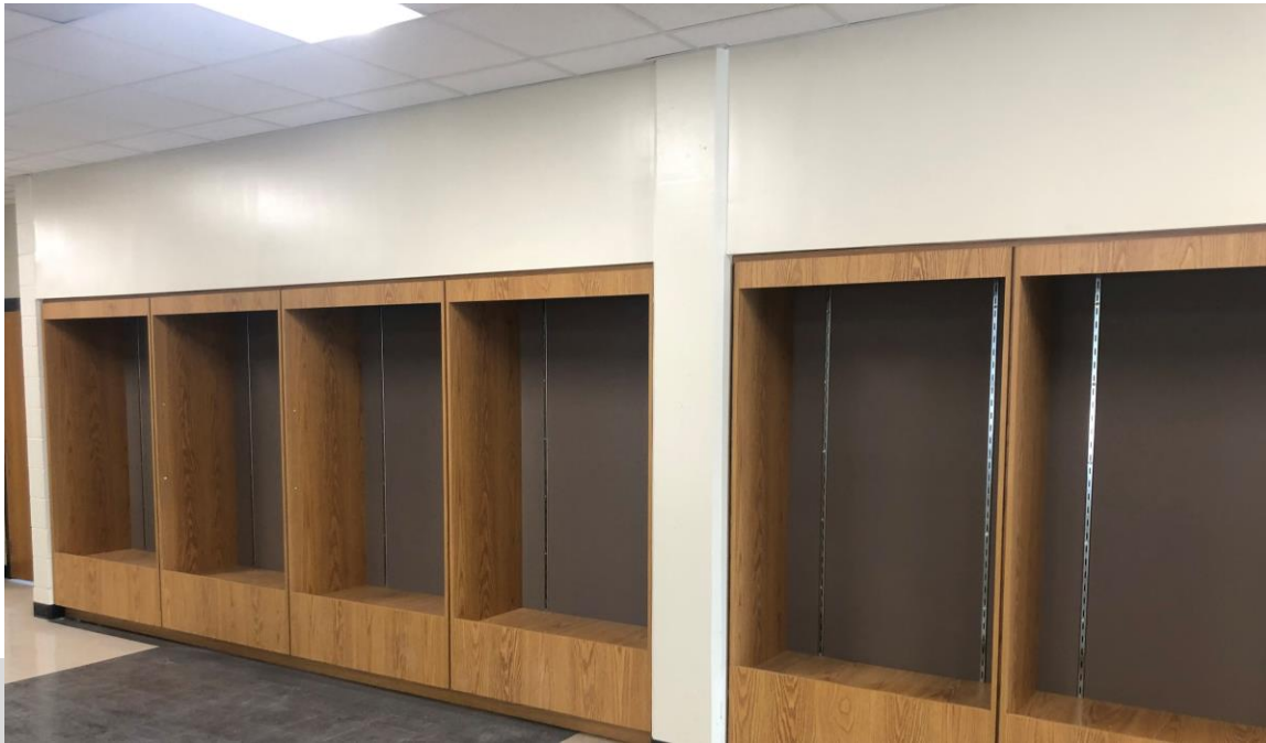
Trophy Case Installed at New Addition