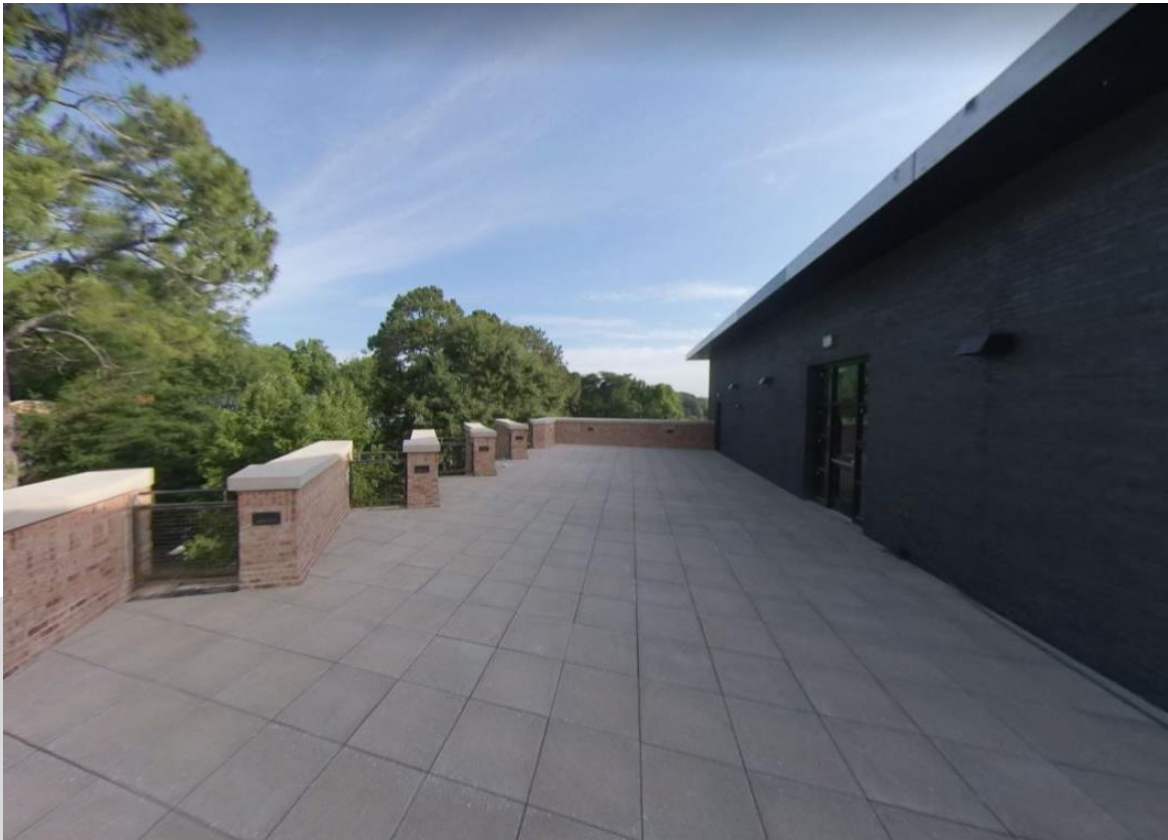
New Addition Building Patio Pavers Completed