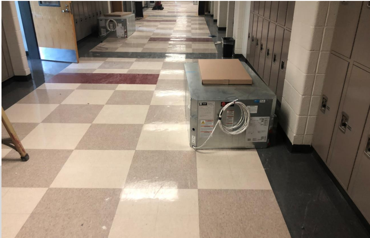
Water Source Heat Pump Swap Completed 4 th Floor of Charles Allen Building