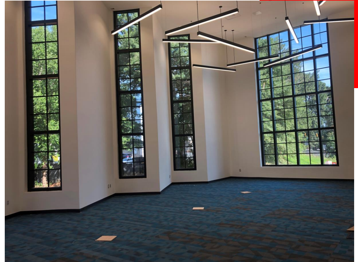
New Addition Building Media Center